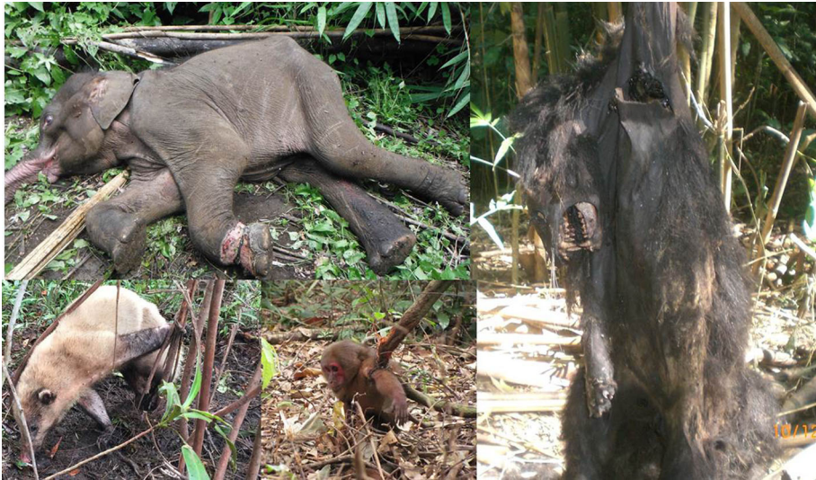
Fig. 1 Threatened species caught in snares in Southeast Asia. Clockwise from top left: Asian elephant Elephas maximus , Cambodia; Asiatic black bear Ursus thibetanus , Laos; stump-tailed macaque Macaca arctoides , Laos; hog badger Arctonyx collaris , Cambodia

products were seen as a delicacy or as having special curative powers (Nijman 2010). Increasingly, however, the use and consumption of wild products is viewed as indication of status and wealth (Shairp et al. 2016). This is particularly apparent in urban centers throughout the region and these practices are no longer solely reserved for the privileged parts of society (Sandalj et al. 2016). Legal wildlife farming in the region, particularly in China, Indonesia, and Vietnam (Brooks et al. 2010), renders it easy to launder wild caught animals and exacerbates the challenges associated with enforcement in addition to legitimizing the consumption of wildlife products. Leaving aside the ethical and enforcement issues associated with wildlife farms, studies show a consistent consumer preference for wild, as opposed to farmed, meat (Drury 2009).