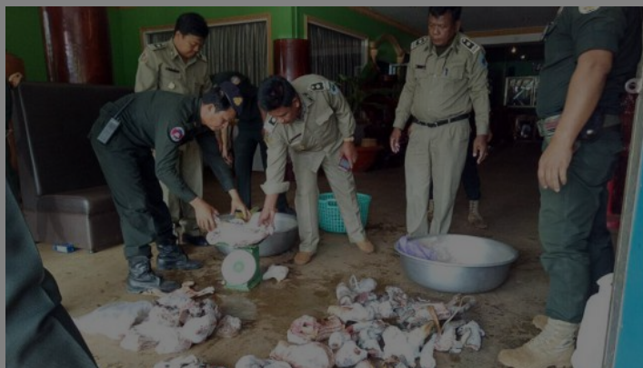
Officials weigh seized wildlife meat late last week in Ratanakiri province.